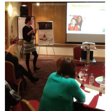
Education Scotland - Inclusion Conference 2015

We would like to welcome new members to the Parent Council this year.